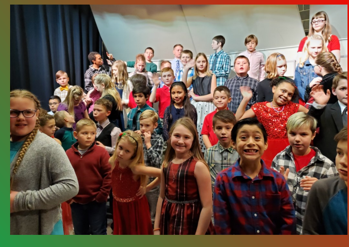
The Nutcracker Suite